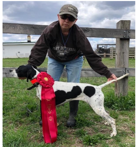
Abs – 2 nd Open Walking Gun Dog Stake