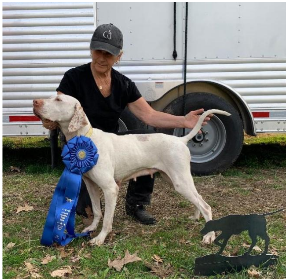
Rilo – 1 st Open Walking Gun Dog Stake