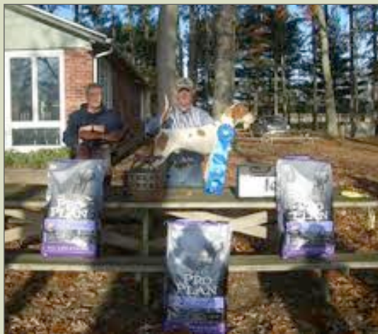
HELP THE AMERICAN POINTER CLUB

Do not miss this opportunity to promote your products to dog, horse and hunting and sporting enthusiasts!